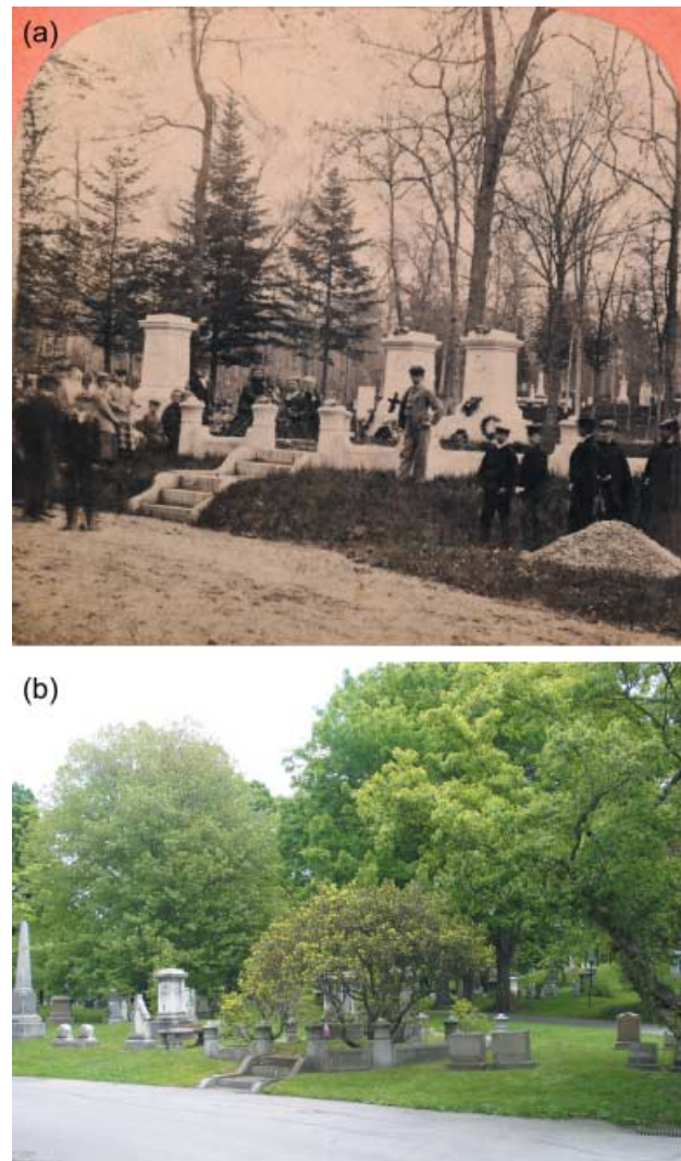
Fig. 3 (a) A picture of the Lowell Cemetery in Lowell, Massachusetts, USA taken on 30 May 1868, a relatively cold year, in which the leaves are not yet out. (b) The same scene taken on 30 May 2005, a relatively warm year, in which the leaves are already flushed out.

Botanical gardens can further contribute to climate change research through investigations of the physiological and anatomical characteristics of plants that make them more or less susceptible to the effects of climate change, and through