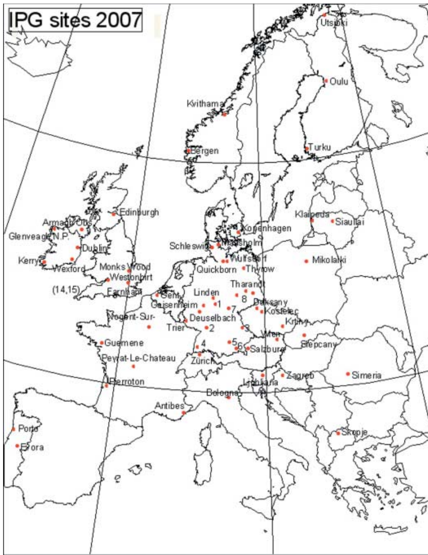
Fig. 2 Map of botanical gardens and other sites in Europe participating the International Phenological Gardens (IPG) project.

botanical gardens and other sites throughout Europe. The purpose of using cloned material is to reduce the amount of genetic variation, so that variation in phenology reflects the influence of environmental factors rather than genetic differences among individuals.