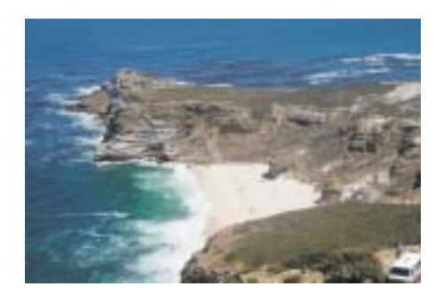
Cape of Good Hope

24 SEP SUN From the city we'll make a full circuit of the Cape Peninsula. Cosmopolitan Sea Point -