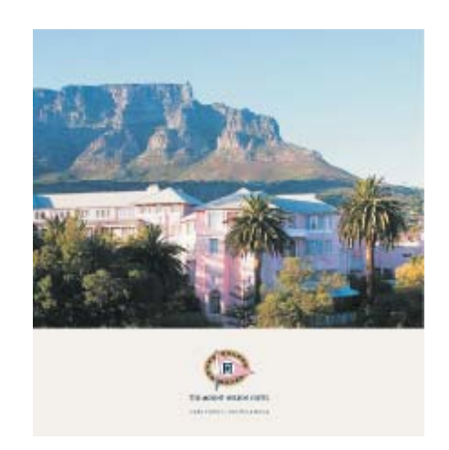
Mount Nelson Hotel

30 SEP SAT Transfers to the airport will be provided (cost included in basic tour price) according to individual participants flight schedules. Drop off at Cape Town International airport. (B) See separate brochure for extension tour offer - Victoria Falls & Botswana Safari.